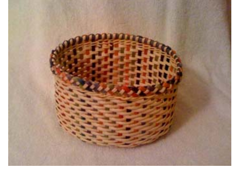
SA 643 Saturday 9:00am-4:00pm

Weave this little wall basket and add some pottery with an accent of waxed linen or hemp. Pottery pieces may vary in color and style. All tools will be supplied to be used in class.