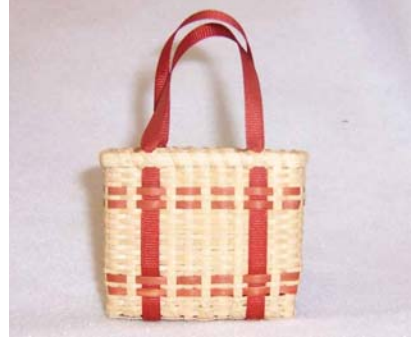
FR 436 4:00pm-9:00pm Friday

This is the smaller version of Kathy's basket angels standing 12" tall. It is accented with rusted wings and holds a rusted tea light clip with scented LED tea light. Country berries are used for halo and accents.