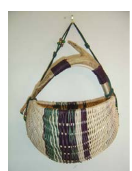
SA 825 Saturday 8:00am-5:00pm