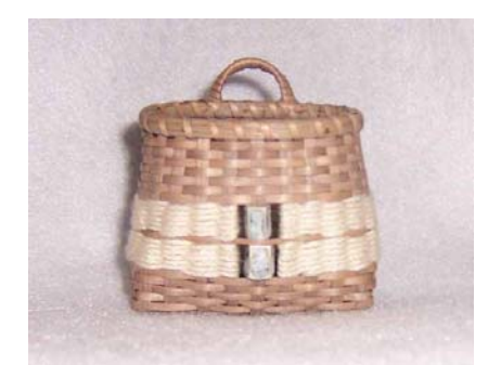
SA 638 Saturday 9:00am-4:00pm