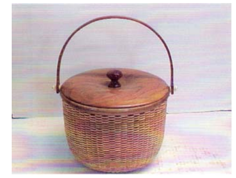
FR 830 Friday 2:00pm-11:00pm