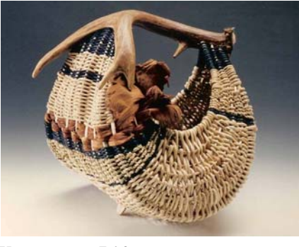
FR 627 Friday 3:00pm-10:00pm