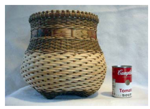
SA 862 Saturday 8:00am-5:00pm