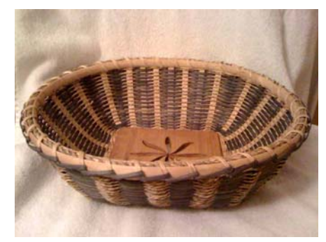
FR 644 Friday 3:00pm-10:30pm