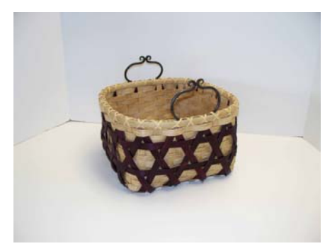
FR 686 Friday 3:00pm-10:00pm

Easy weaving on this large half bushel capacity basket. Handles are harness quality in a choice of colors and resist soiling. This class includes the instructions for Anne's Bushel Handbag.