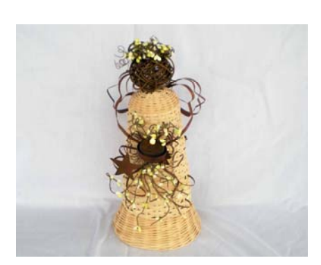
FR 433 Friday 4:00pm-9:00pm