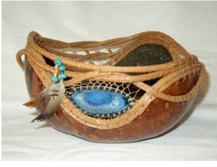
SA 621 Saturday 9:00am-4:00pm

Basket is woven on a mold (which you keep) and wood base. This is a continuous 2-1 twill and is finished off with leather handles. It is a great small tote for just a few items.