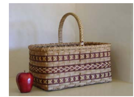
SA 803 Saturday 8:00am-5:pm