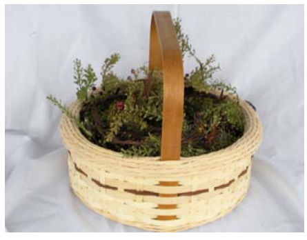
SA 632 Saturday 9:00am-4:00pm

Let your imagination run wild! What you would like to learn...we would like to teach you, wrapping, floating, couching, teneriffe, knotless netting, beads and feathers. (You absolutely must have previous pine needle coiling, i.e. how to start your coil on a gourd.)