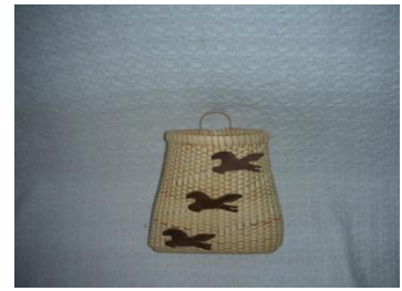
FR414 Friday 1:00-5:00