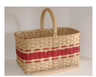
SA862 Saturday 8:00-5:00