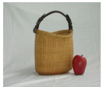
FR407 Friday 1:00-5:00