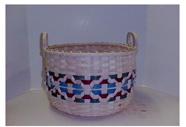
FR 601 Friday 1:00-7:00