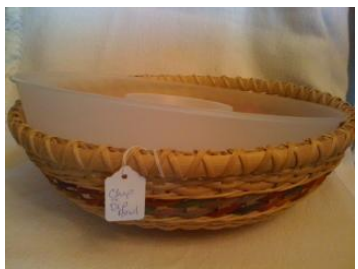
SA858 Saturday 8:00-5:00