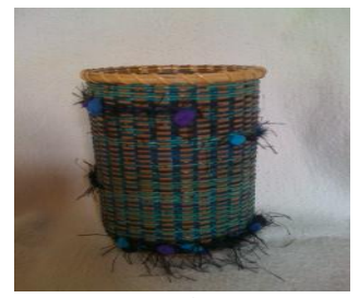
SA860 Saturday 8:00-5:00