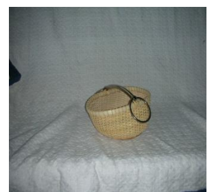
FR408 Friday 1:00-5:00