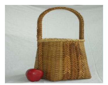
FR416 Friday 1:00-5:00