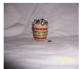
FR490 Friday 1:00-5:00 SA490 Saturday 8:00-12:00