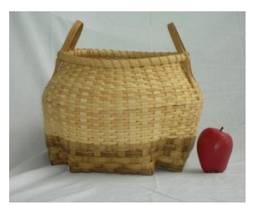
FR410 Friday 1:00-5:00