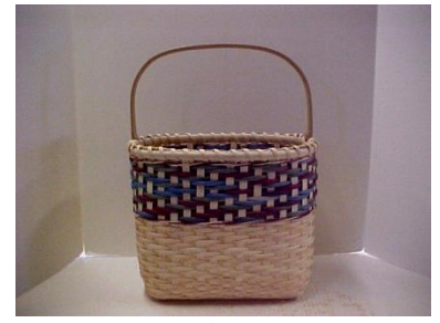
SA653 Saturday 8:00-5:00

8 hours H: 8" w/o lid, D: 8" Intermediate/Advanced $150