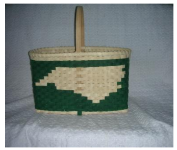
FR409 Friday 1:00-5:00