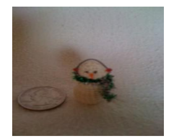
FR420 Friday 1:00-5:00