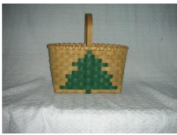
FR412 Friday 1:00-5:00

4 hours 21" x 10" x 16 or 20" All levels $49