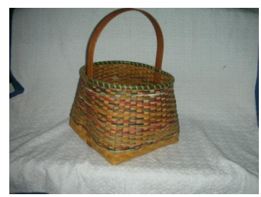
FR415 Friday 1:00-5:00