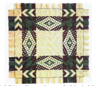
SA879 Saturday 8:00-5:00