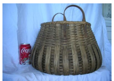
FR413 Friday 1:00-5:00