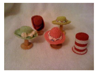
FR417 Friday 1:00-5:00