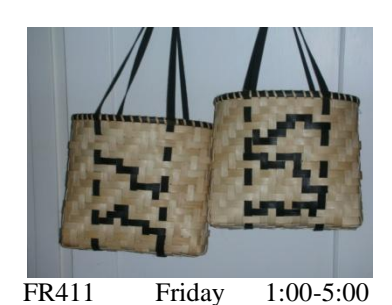
Herringbone Shoulder Bag Anne Coleman

In this class choose from a herringbone pattern that weaves a solid bottom and sides and uses a shaker tape handle or choose a basket weave style in a choice of sizes. Black random color is optional and can be done on one or both sides. The color is permanent, no dyed reed.