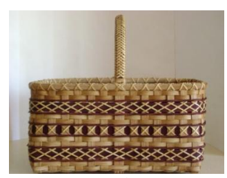
SA863 Saturday 8:00-5:00

8 hours 15" x 8" x 8.5" Intermediate $79