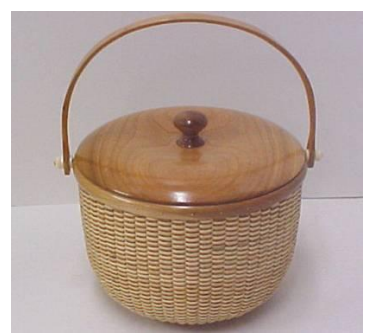
SA652 Saturday 8:00-5:00