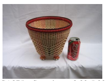
SA875 Saturday 8:00-5:00

8 hours 16" x 13" x 14" H All Levels $75