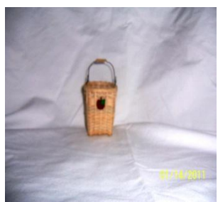
FR491 Friday 1:00-5:00 SA491 Saturday 8:00-12:00

4 hrs 2" x 2" x 1 5/8" D: 8" All Levels $35