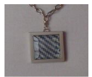
FR418 Friday 1:00-5:00