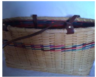
SA859 Saturday 8:00-5:00