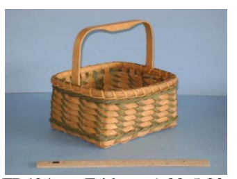
FR424 Friday 1:00-5:00