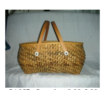
SA857 Saturday 8:00-5:00

8 hours 16" x 10.5" x 15.5" All levels $60