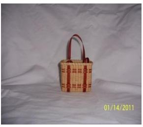
FR494 Friday 1:00-5:00 SA494 Saturday 8:00-12:00

4 hrs 3/8" x 1 3/8" x 2 ½" D: 6 ½" All Levels $40