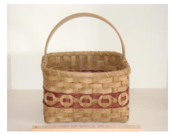
FR621 Friday 1:00-7:00