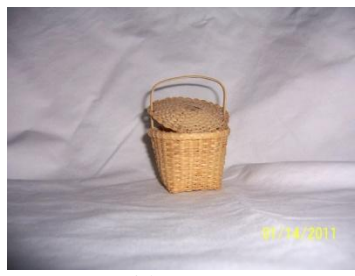
FR495 Friday 1:00-5:00 SA495 Saturday 8:00-12:00