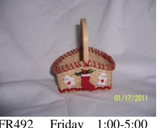
FR492 Friday 1:00-5:00 SA492 Saturday 8:00-12:00

4 hrs 2 ¾" x 1 ¾" x 2 ½" D: 8 3/8" Intermediate $40