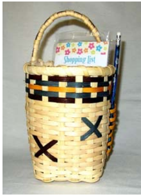
SM- 8 8:00am –12:00 pm JOT IT DOWN Sheila Deason

22 1/2"L x 5"W x 6"H 2 hr. class Fee: $25.00 All Levels