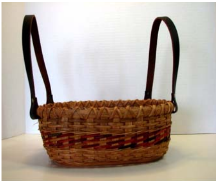
SM-10 8:00am – 12:00 pm FIESTA FRENCH RAND TOTE Wanda Harris

19"L x 13"W x 14"H 8 hr. class Fee $80.00 Intermediate