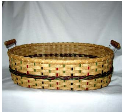
SM-11 8:00 am - 12:00 pm BUTTERS TRAY Candice Williams

11"L x 9 1/2"W x 11"H w/Handles 4 hr. class Fee: $35.00 All Levels