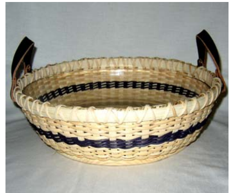
SM-12 8:00am - 12:00 pm TAMMY'S PLATTER Margaret Hardin

20" L x 15"W x 6 1/4"H w/Handle 4 hr. class Fee: $58.00 Intermediate