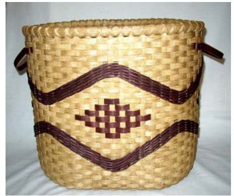
SM-9 8:00am-5:00pm DIAMONDS & WAVES Vicki Worrell

3 1/2"L x 3 1/2"W x 9"H w/Handle 4 hr. class Fee: $25.00 All Levels