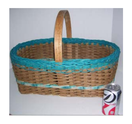
SM-10 8am - 5pm