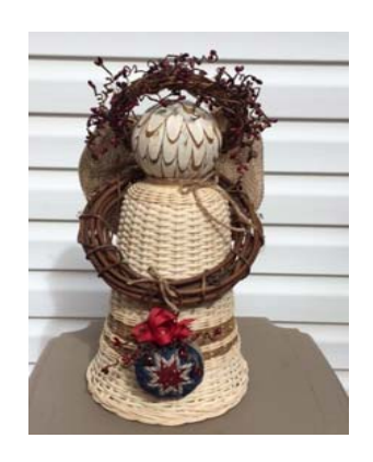
SM-4 8am - 5pm