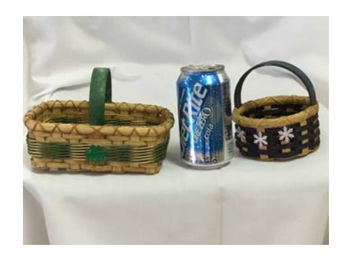
SA-2 1pm - 5pm

7 ½" L X 5" W X 5" H 4 hr. class Fee: $32 All Levels