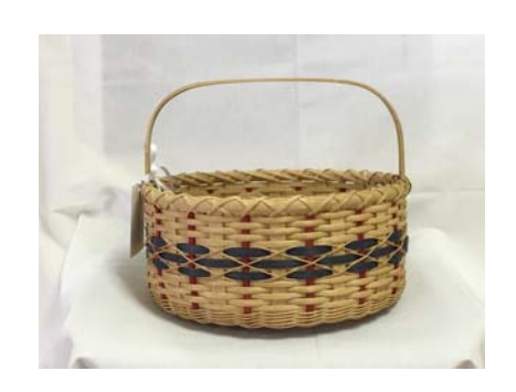
SM-7 8am - 3pm