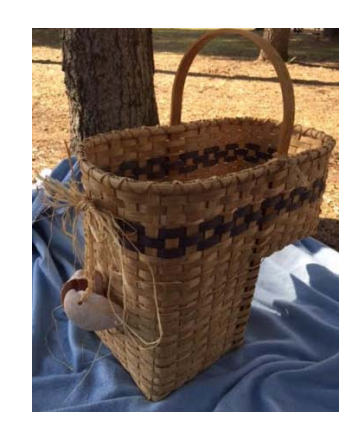
SM-3 8am -5pm

Decorate your door or wall with this tall each season to enjoy all year long. Metal/iron hanger is included.