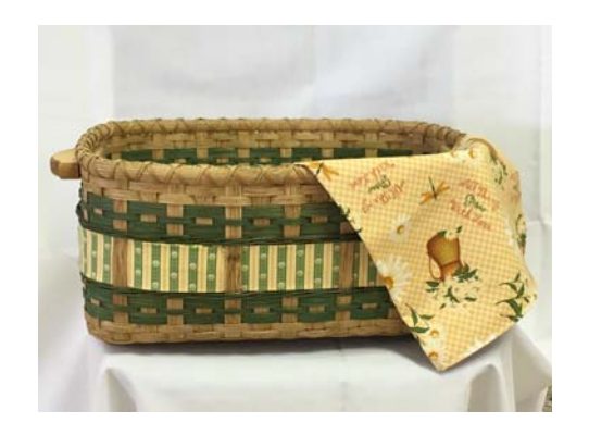
SM-9 8am -5pm