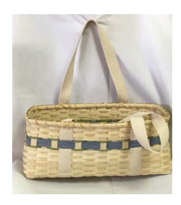
SM-8 8am - 3pm