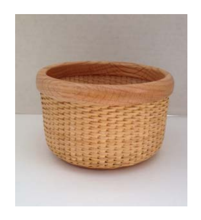
SM-1 8am - 3pm