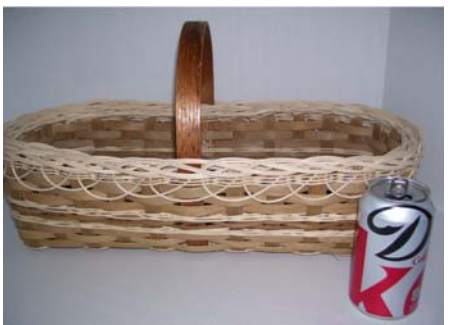
SM-11 8am - 5pm